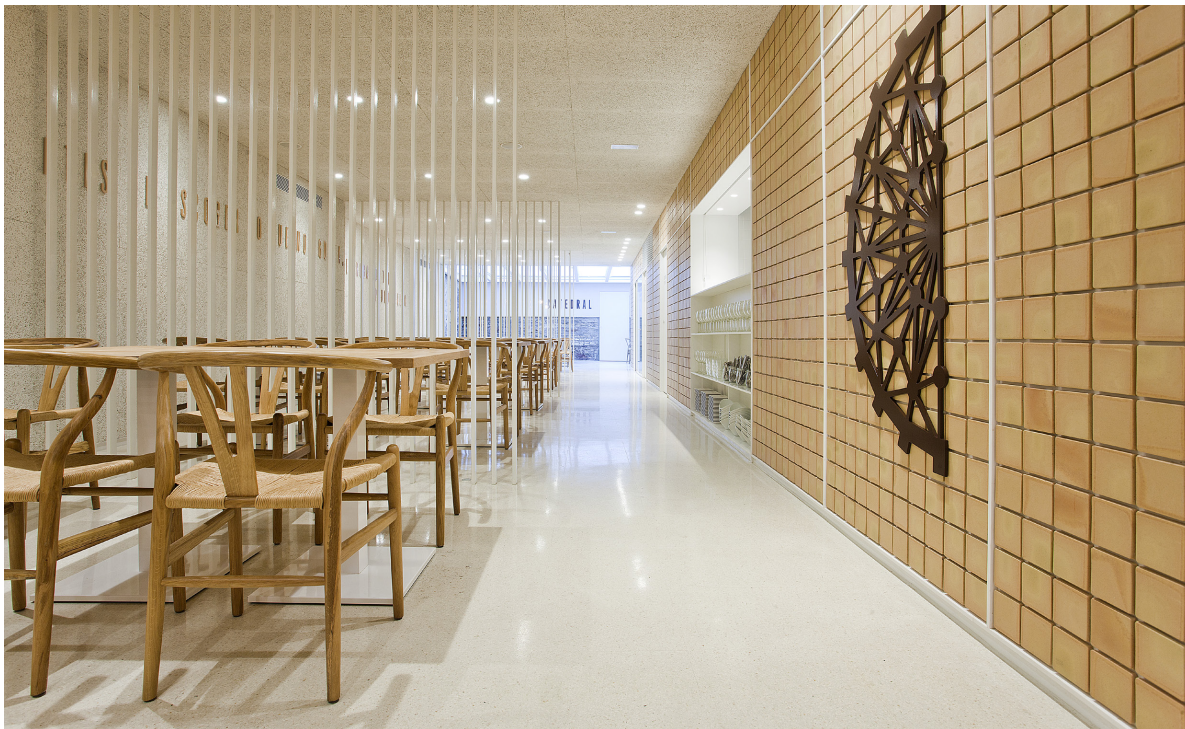
Figure 1. Installed product

The results of the Life Cycle Analysis (LCA) of this EPD are based on data provided by manufacturers of 40% of the Spanish ceramic tile production. The participants have provided all the data and, therefore, it is considered that the results obtained in this study are representative of the Spanish ceramic tile manufacturing sector. The scope of this EPD is from cradle to grave.