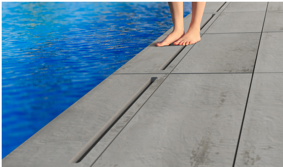
Figure 2. Installed product