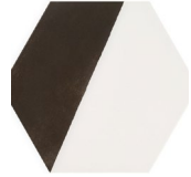
Porcelain Tile – HexArt Pop Nero 8” Hexagon Matte