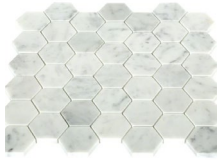
Sealed Stone – Carrara 2” Hexagon Polished Marble