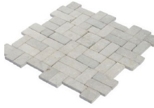
Unsealed Stone – Nature Antique Pebble Pram Gray