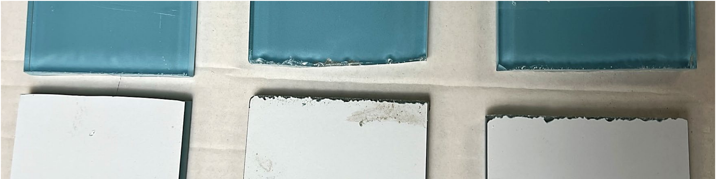
(3) 7" Wet Saw