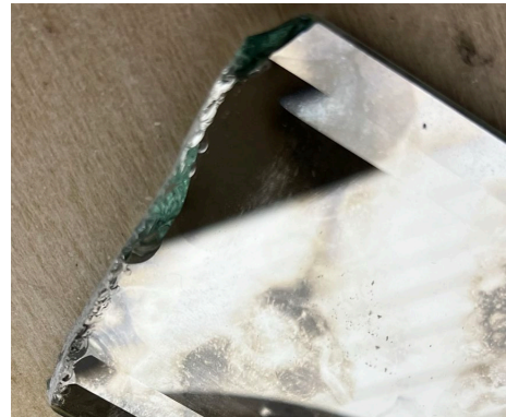
Edges are rough – unless this tile is covered it cannot be used.