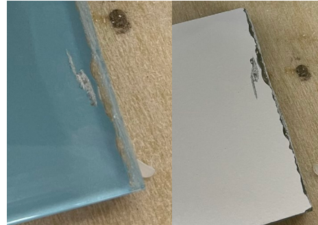
Chips in the backing – this chip can be seen from the front.